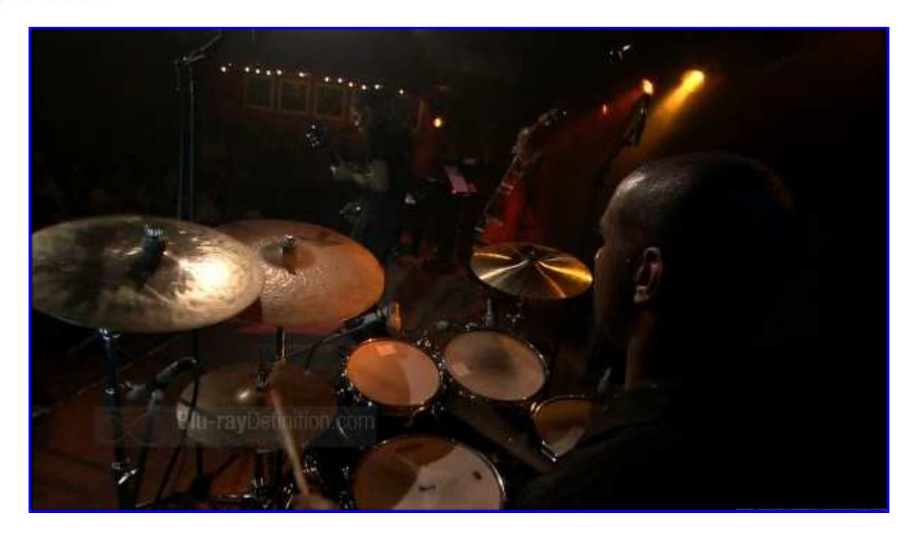
The supplements on this release are limited to one interview segment with Stanley Jordan briefly speaking of