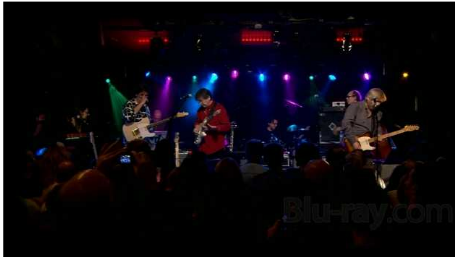
The band takes the stage.

Carlton's replacement in the L.A. Express, ace sideman Robben Ford, is the other "name" guest star on this 2006 outing taped at Paris' New Morning nightclub (as part of the club's 25th anniversary celebration festivities), which otherwise features the cream of French studio musicians in an informal assemblage known as Autour du Blues (Around the Blues). There's obviously nothing lost in the translation here, as this Franco-American mélange blends beautifully together. While I doubt few if any stateside will recognize many, if any, of the non-American musicians, they include Francis Cabrel, Denys Lable, Michael Jones, and Patrick Verbeke. This is music that is both wonderfully loose and incredibly tight. The looseness shows in the relaxed arrangements and friendly atmosphere permeating all of the performances. The tightness comes from the acute playing of the rhythm section, which works here like a well oiled machine, punching just the right accents and keeping the bulk of the evening nicely propulsive.