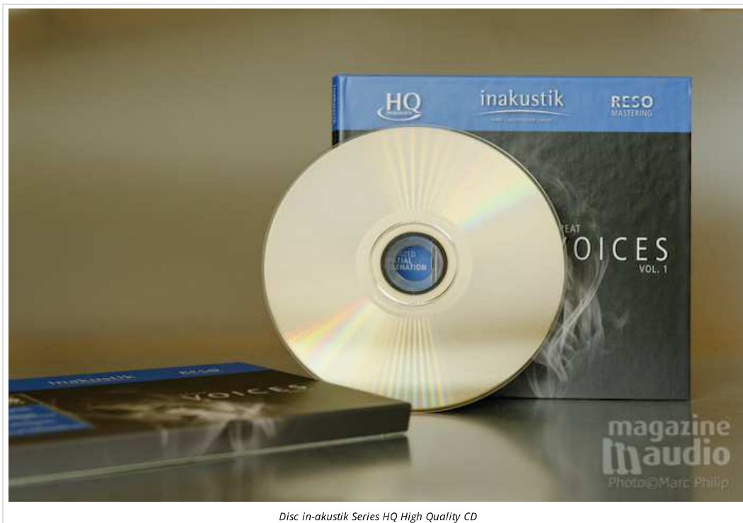
Disc in-akustik Series HQ High Quality CD

No, just get the best of CD. Our company is the pure, everything that contributes to the perfection of listening pleasure.