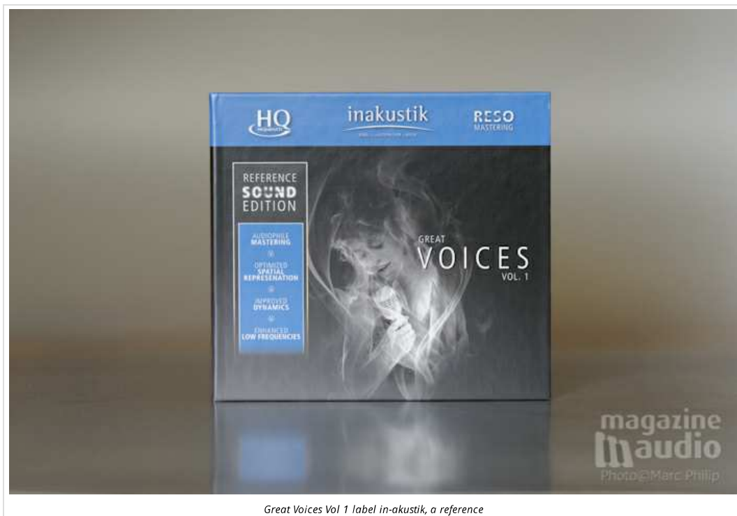
Great Voices Vol 1 label in-akustik, a reference