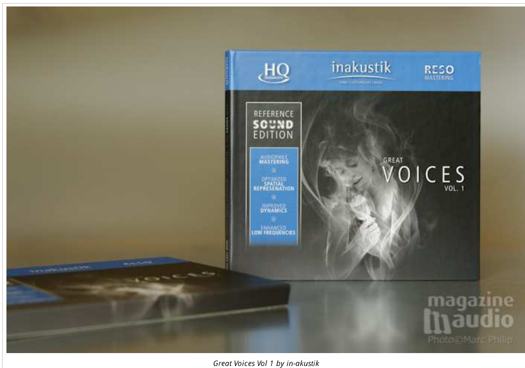
Great Voices Vol 1 by in-akustik

The three pillars are in-akustik: Cables & Accessories / Music & Media / Tech Ambien.