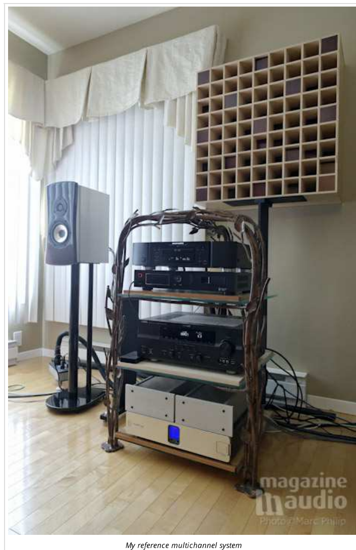
My reference multichannel system