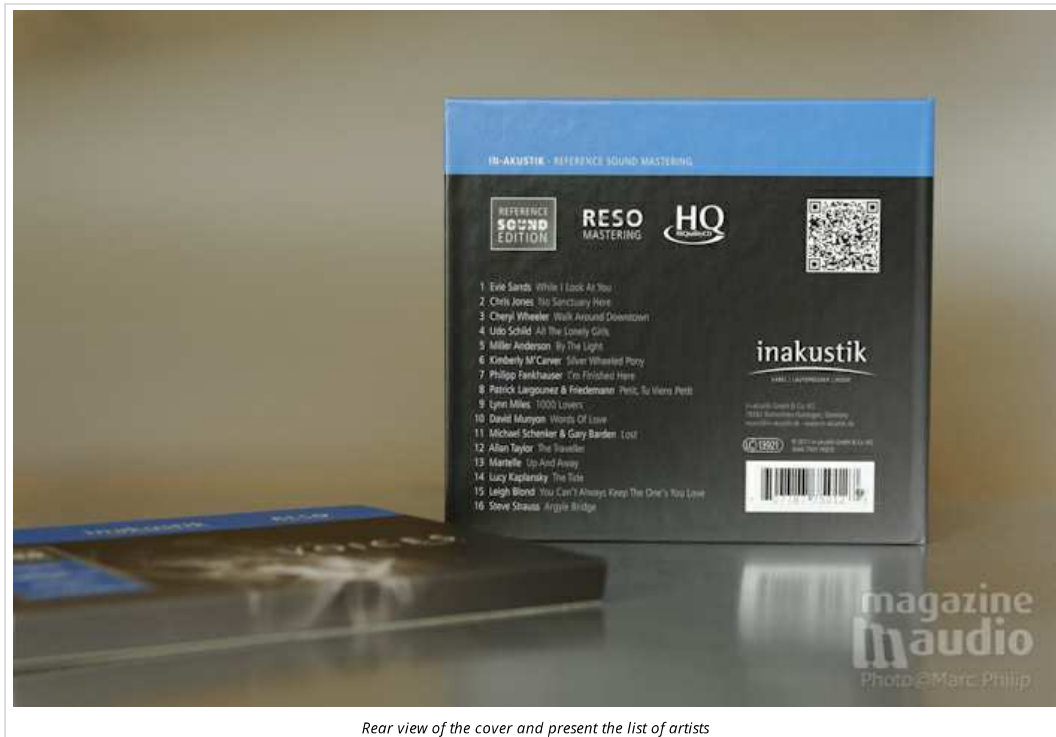
Rear view of the cover and present the list of artists

This was not done on purpose. To make a selection like this we must listen to the approximately 200 pieces. On Vol. He is vice versa.