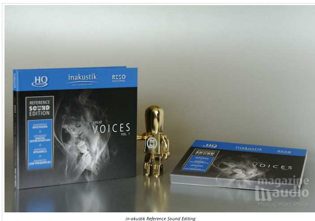
in-akustik Reference Sound Editing

It is rare enough to be blown away by music from a CD, not keep it to themselves. That is why I am pleased to share with you my favorite moment of the heart.