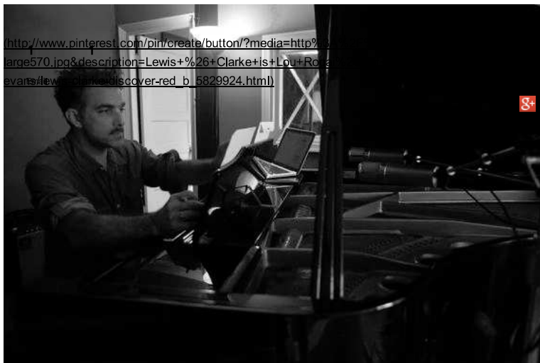
( http://images.huffingtonpost.com/2014-09-16-Rogai3 )

( https://www.facebook.com/sharer/sharer.php?u=http%3A%2F%2Fwww.huffingtonpost.com )