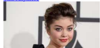
2 days ago huffingtonpost.com huffingtonpost.com (AOL) Lauren Zupkus Lauren Zupkus Most Popular on HuffPost