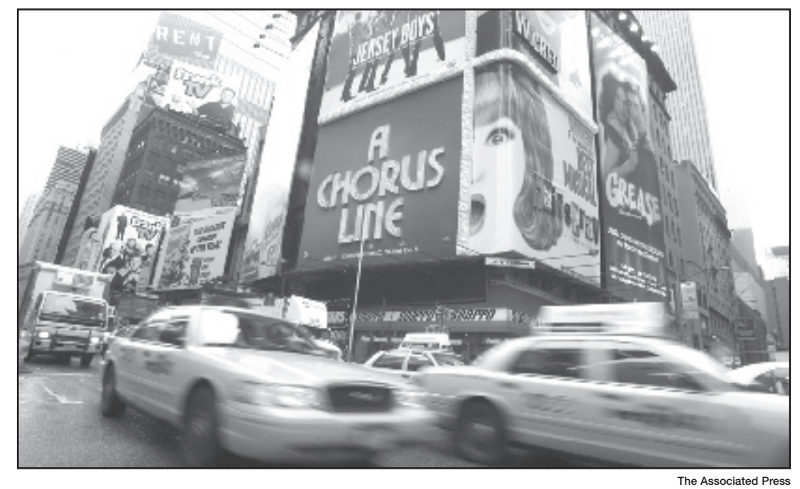
Taxi cabs make their way down Broadway under billboards advertising Broadway shows, Nov. 19, in New York's Times Square.