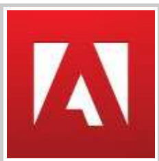
Adobe launches Collage and Proto apps for iPad (TechnologyTell)