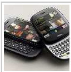
Who's more smartphone savvy: Gen X or Gen Y? (Gadgetell)