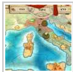
Tiny Token Empires for iPhone, iPod Touch review (Gamertell)