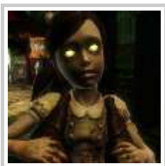
Return to Rapture this January with Bioshock 2 for OS X (Appletell)