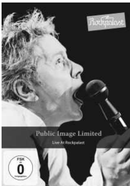
Public image Limited Rockpalast DVD