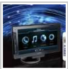
Access your iPhone's apps and more from your car's dash with Clarion's Next GATE (TechnologyTell)