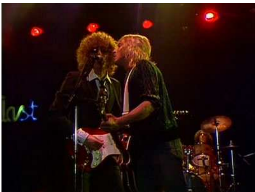
Ian Hunter & Mick Ronson

One of the things that surprised me, because it's such a given that I haven't thought about it in ages, is how skilled and magnetic a guitarist Mick Ronson really was. The adulation from collectors and fanboys is almost a cliché now, but he truly deserves any and all praise he gets. He and Hunter seem to fit together well, and have a non-competitive, natural relationship on stage.