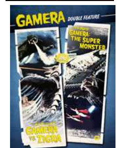
Gamera vs. Zigra / Gamera: The Super Monster