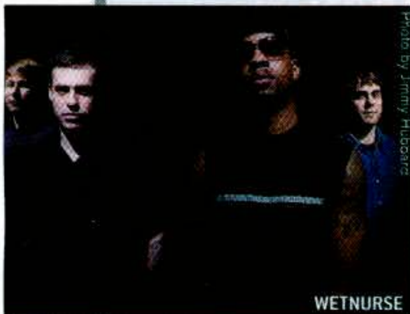
WETNURSE