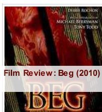
Film Review: Beg (2010)