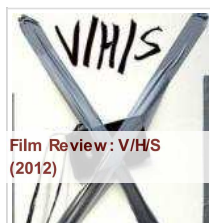
Film Review: V/H/S (2012)