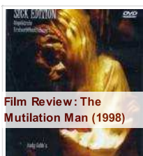
Film Review: The Mutilation Man (1998)