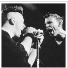
Toronto Underground Cinema celebrates best Cana ...