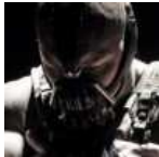
11 Things That Didn't Work in The Dark Knight Rises