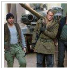
Interview: Terry Crews and Randy Couture on The ...