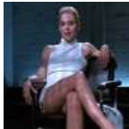
Top 10 Most Paused Movie Moments