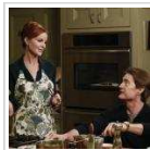
Interview: Kyle MacLachlan talks 'Peace, Love, ...