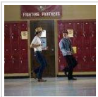
Interview with director Craig Brewer about his ...