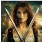
The 10 Biggest Movie Mistakes