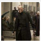
Worst Films of 2011 Pt. 2