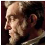
Joseph Gordon-Levitt and Daniel Day-Lewis 'Lincoln' Trailer