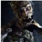
The Best Movies You Probably Haven't Seen