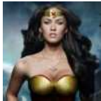
10 Superheroes Who Really Don't Need Their Own Movie