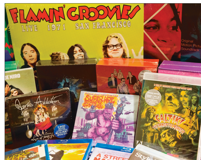
Some of the titles available at MVD Entertainment.