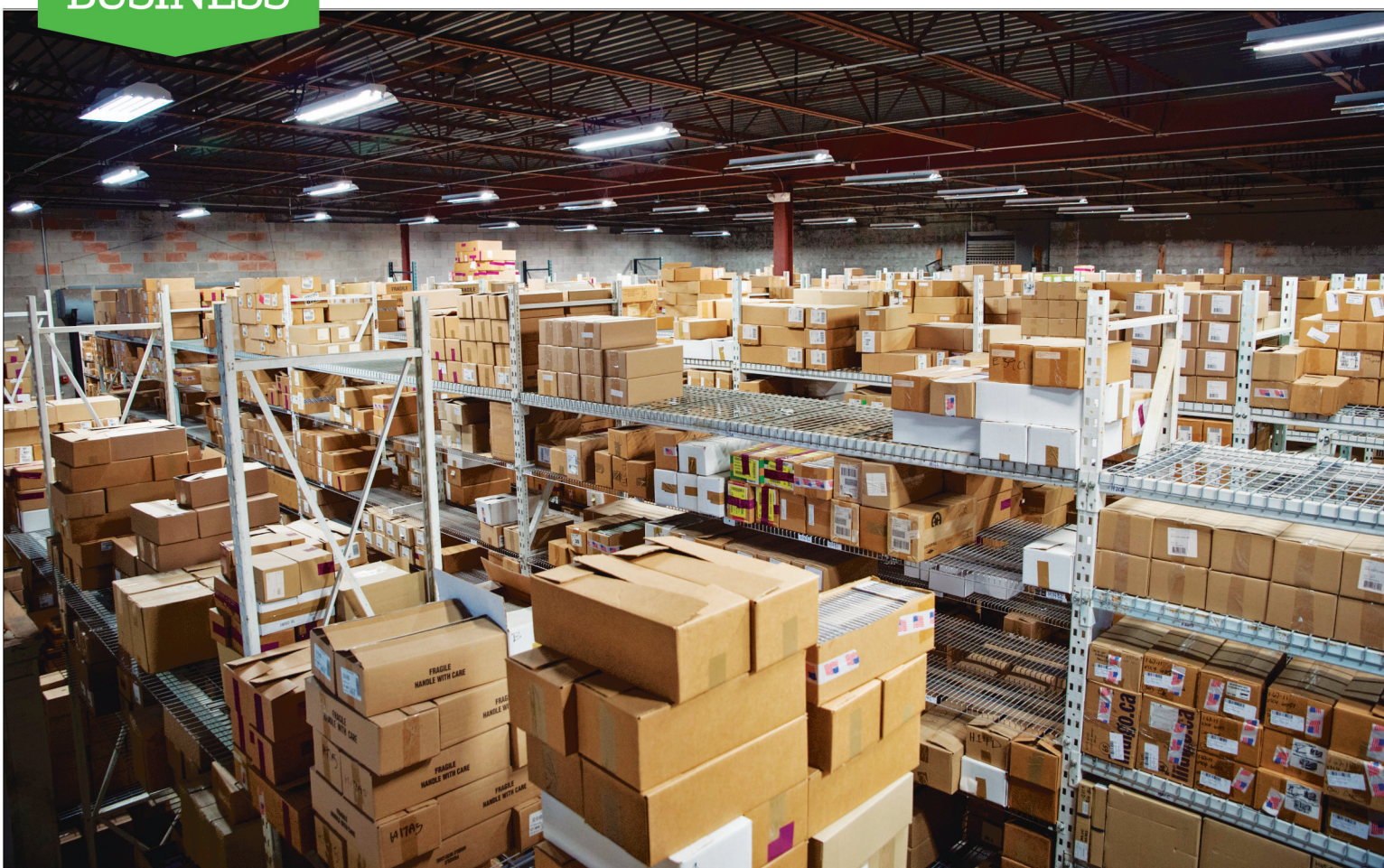
One of the warehouses, packed to the brim with titles of varying mediums, at the MVD Entertainment headquarters in Pottstown.