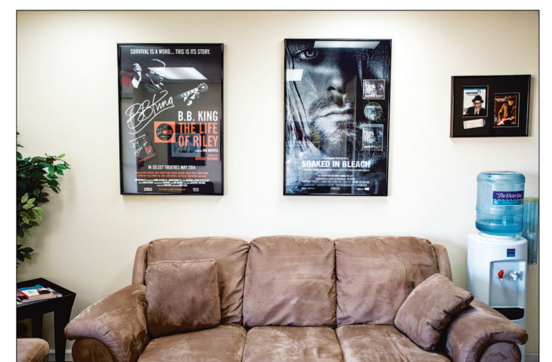
Posters for home-grown releases in the lobby of MVD's headquarters.

STELLAR STARTUPS philly.com Awards Event ► When: 5:30-8:30 p.m. Tuesday, Sept. 12. ► Where: Fels Planetarium, Franklin Institute, 222 N. 20th St., Philadelphia 19103. ► For more information: www.philly.com/stellarstartups NEXT SUNDAY ► What the finalists pool reflects with respect to the region's start-up community.