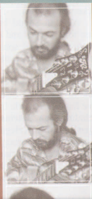
LENNY BREAU Master Class