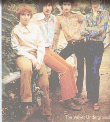
The Velvet Underground