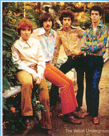
The Velvet Underground

MVD Entertainment Group continues to release numerous titles in its Under Review series. The bands getting the Under Review treatment of late include the Smiths, Radiohead, Nirvana, Joy Division, Captain Beefheart, the Rolling Stones, Syd Barrett, David Bowie and AC/DC. MAGNET checked out a handful of the titles and found that these pleasing documentaries provide a good starting point on a variety of influential bands and performers.