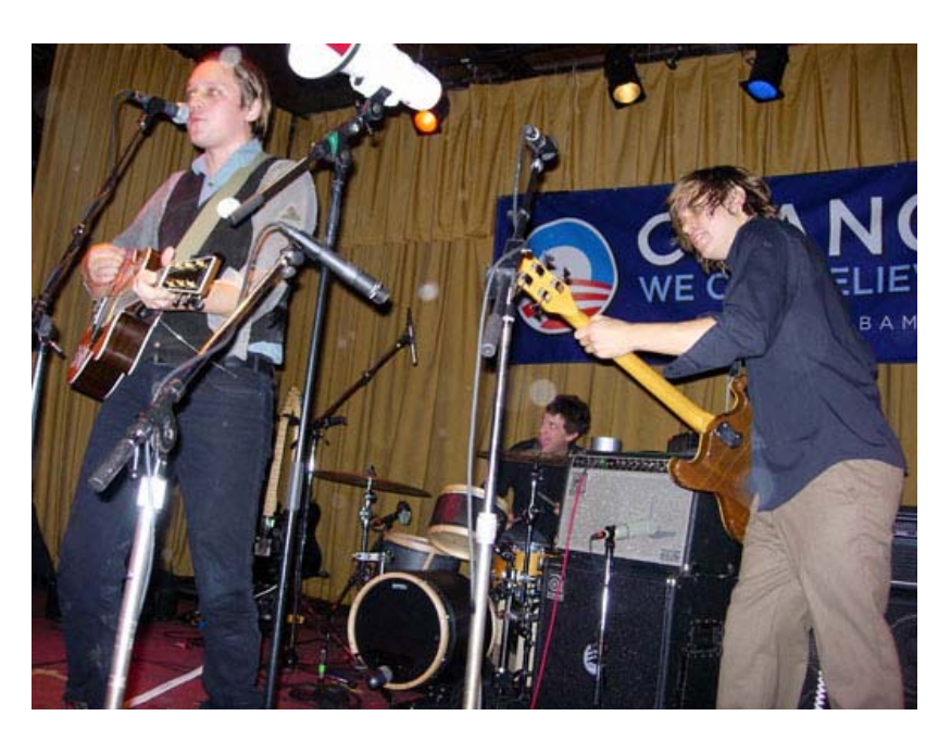
Braving long lines, rain, and a rapidly descending temperature, the throngs of Obama supporters/Arcade Fire fans packed the one-time Croatian dance hall in the slowly-but-surely gentrifying Waterloo neighborhood. There was a surprisingly stark contrast between the two sets: the early show was an almost somber affair, while the second set was a raucous revival of sorts.