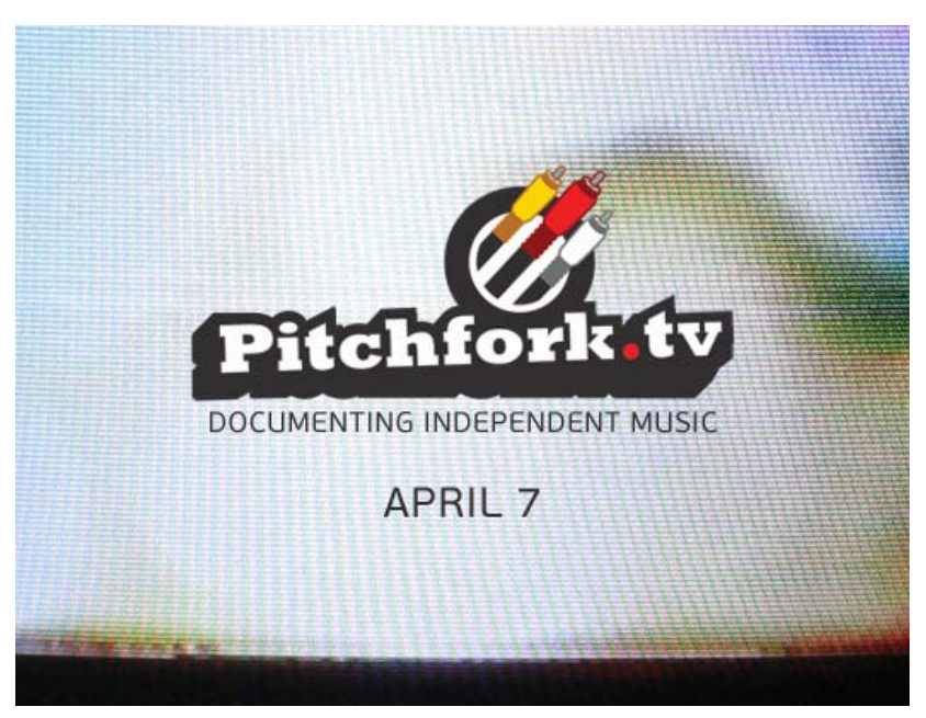
The 24-hour music network was such a great concept. What happened? Given music's nearly inexhaustible supply of notable artists and genres, there are no limits to how deeply it can be explored. But despite all the footage we've seen of high-profile rock and pop artists hitting their creative strides, similar documents of independent artists are far less accessible, if they exist at all.

Pitchfork to Launch Online Music TV Channel April 7