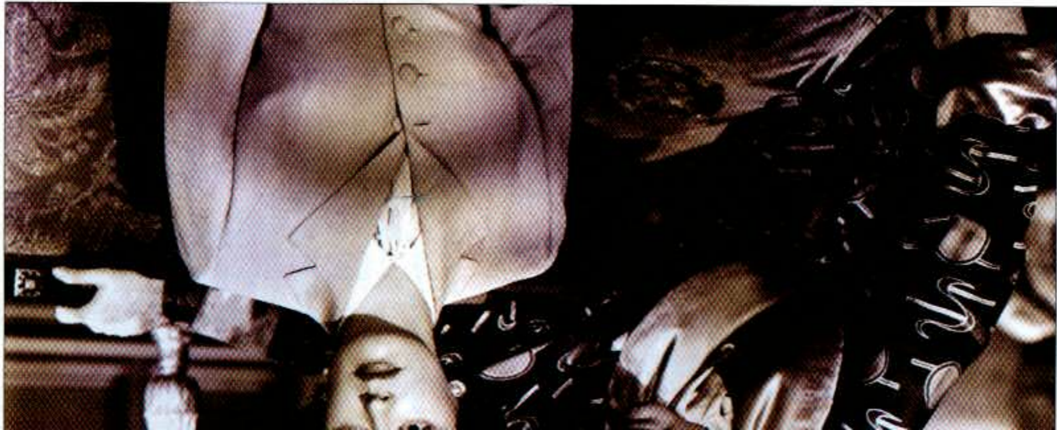
The two-disc Strangers on a Train will sport an "alternate" version, a commentary, a documentary and features.

T he Alfred Hitchcock Signature Collection (street Sept. 7, prebook Aug. 10) will include remastered versions of eight of the director's films: Dial M for Murder , Foreign Correspondent , Suspicion , The Wrong Man , Stage Fright , I Confess , Mr. and Mrs. Smith and a two-disc special edition of Strangers on a Train . The set is $99.92; singles are $19.97, except Strangers on a Train ($26.99).