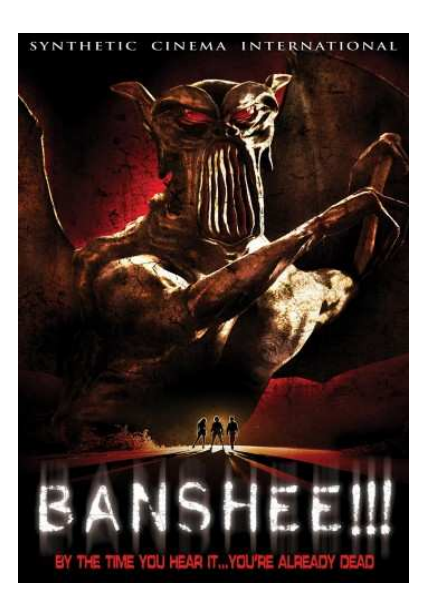
DVD Review – BANSHEE!!! Directed by Colin Theys Synthetic Cinema International

Low-budget, "grindhouse" horror flicks generally rely on three main staples, three basic, fundamental features that lie at the core of everything that is film-based horror entertainment: violence/gore, cheap laughs, and titties. These three ingredients must be fused in perfect harmony for it to work properly and be entertaining. Now some films may go with one over another, feeling they want to really hammer home the violence/gore, cheap laugh, or titty aspect of their movie to suit their purposes but they generally still have all three in the movie. Not BANSHEE! Oh no, the geniuses behind BANSHEE!!! decided they were going to throw one out the window, just completely toss it by the wayside like a cheap piece of trash. And which one did they cut out? By far the most important god-damn one: titties. There isn't a single titty in the entire piece of crap douche-fest.