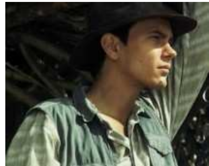
River Phoenix

A massive drug overdose caused the October 31, 1993, death of young, handsome, talented River Phoenix. He had speedballed heroin and cocaine and his body was found to have a cocaine level eight times that which is lethal. Phoenix was regarded as "Hollywood's golden boy—vegan, ethically minded, squeaky clean." Few outside his circle of family and close friends knew of the struggles with drugs he had been going through for two years. He would get straight for a few months, then binge, and he did everything from pills to heroin.