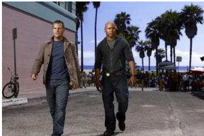
See all 3 photos | Click to enlarge

"NCIS: Los Angeles: The First Season" (CBS/Paramount, 2009-10, six discs, $64.99). LL Cool J and Chris O'Donnell make an appealing crime-busting team in this spinoff of "NCIS," which includes a pair of crossover episodes featuring the original show's quirky forensics wizard Abby Sciuto (Pauley Perrette).