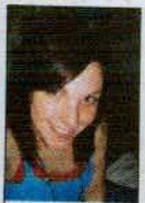
KRISTINA KERCHER Contributor

On June 1, the top selling female group in country music will be releasing a new album, their first in three years. Playlist includes a list of the Dixie Chicks' themselves favorite songs from their past four albums. The 12 songs include "Wide Open Spaces" and "You Were Mine"