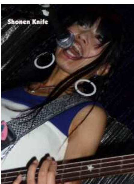
Shonen Knife, Never Ever, Fatastica Bastidas, Spaceland,