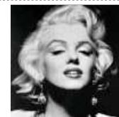
Review by Chad Added: November 08, 2010

"It's not a porno film - it's a horno film!" So reads the tagline for Horno , a film that attempts to blend together the horror genre with the (softcore) porn genre. It's been done before, naturally, but I'm always up for one of these movies and I usually tend to enjoy them. Honestly, what could be better than picking two of the sleaziest genres in film and blending them together? Who doesn't want to see a bunch of blood and guts alongside a huge amount of T&A? These movies certainly have an audience, and I am quite proud to be counted amongst them.