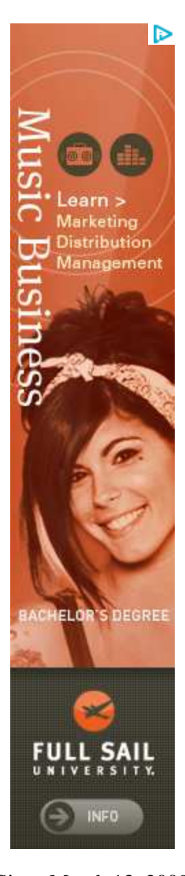
Since March 13, 2009