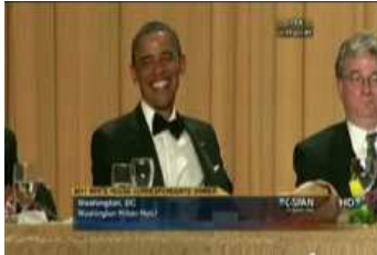
Watch Obama Chuckle at Osama Joke the Day Before His Death [Video]