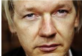
Julian Assange: 'Facebook is the Most Appalling Spying Machine That Has Ever Been Invented'