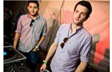
Holy Ghost! Turn into Their Fathers in 'Wait and See' Video