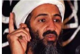
Osama bin Laden: The Symbol and Villain is Gone, What Now?