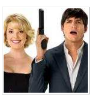
10 Actors Who Don't Care About Movies