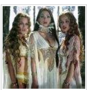
Horror's 10 Sexiest Bloodsuckers of the Niaht

Comment Policy: No hate speech allowed. If you must argue, please debate intelligently. Comments containing selected keywords or outbound links will be put into moderation to help prevent spam. Film School Rejects reserves the right to delete comments and ban anyone who doesn't follow the rules. We also reserve the right to modify any curse words in your comments and make you look like an idiot. Thank You!