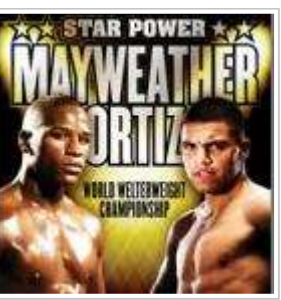
Mayweather vs Ortiz On The Big Screen September