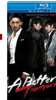
A Better Tomorrow