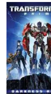
Transformers P Darkness Ris