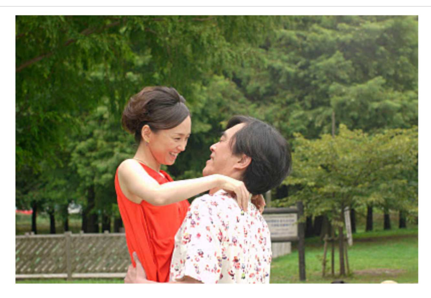
Capsule review | 244 words | 31/12/11

For most of the running time of Ogata's feature debut, we are treated to a gently paced and gorgeously scored little comedy, filled with endearing performances and delightfully deadpan (if, at times, somewhat low-brow) humour. Unfortunately, the final act sees everything wrapped up just that little bit too easily, tidily, and unconvincingly, with its happy ending not feeling particularly well-earned. Still, the film's strengths just about outweigh its weaknesses, with the performances of Masuoka and Nagasaku being particularly noteworthy. Masuoka plays Hiroshi, a talented but undervalued character actor, forever destined to play supporting parts, who lives in the oppressive shadow of his renowned playwright father (Tsugawa). He also regularly finds himself in trouble with the police, with his good nature and unfortunate tendency to be mistaken for others often landing him in gaol. One such incident, though not seeing him incarcerated, does result in his losing out on the opportunity of landing his first leading role, when an act of human decency becomes twisted by a tabloid journalist. It's not all bad, though; another such incident sees his life enriched by his introduction to a feisty, struggling young actress, Aya (Nagasaku), to whom he comes to the rescue when she is erroneously accused of pickpocketry. These two incidents drive the action for the remainder of the running time, with Hiroshi endeavouring to both remedy his casting woes and understand his feelings for Aya.