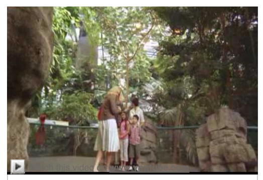
Get the Montréal vibe Enjoy the à la Montréal experience. Discover the city in 2 minutes! youtube.com/tourismemontreal