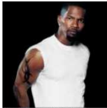
Jamie Foxx + Fantasia