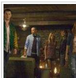
Film Review: The Cabin in the Woods - No Spoilers Just Quite a Rant