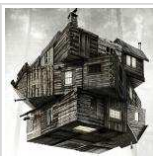
Film News: Cabin in the Woods Trailer