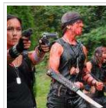
Film Review: Bong of the Dead