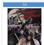
Film Review: The House by the Cemetery