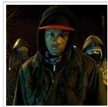
Film News: Ten Must See Movies on LOVEFILM Instant