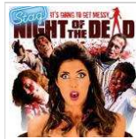
Review: Stag Night of the Dead (Updated Review)