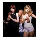
Short Film Review: Hit Girls