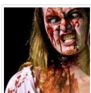
Deadlands 2: Trapped (2009)