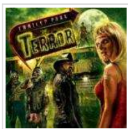
Trailer Park of Terror (2008)