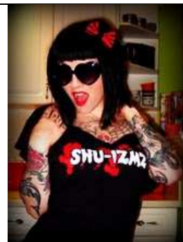
Get your Shuizmz t-shirts now!