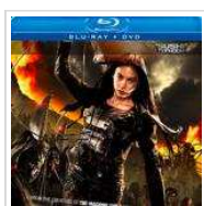
REVIEW: HELLDRIIVER (2010)