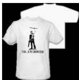
Army of Darkness Boomstick White Shirt