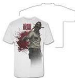
The Walking Dead Dot Splatter Shirt