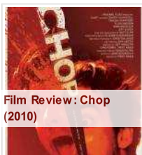
Film Review: Chop (2010)