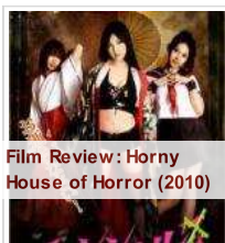
Film Review: Horny House of Horror (2010)