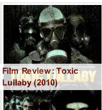
Film Review: Toxic Lullaby (2010)