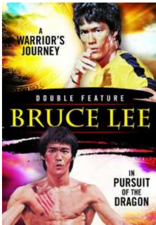
Bruce Lee: A Warrior's Journey & Pursuit of the Dragon | DVD (MVD Entertainment)

Posted on November 1, 2013 by Mighty Peking Man