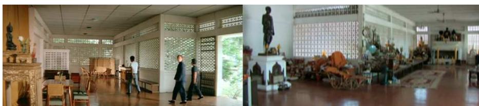
The interior of "The Big Boss" mansion almost looks identical.