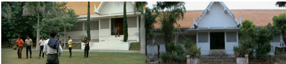
I bet these goons have some interesting stories, especially the guy with the yellow shirt.