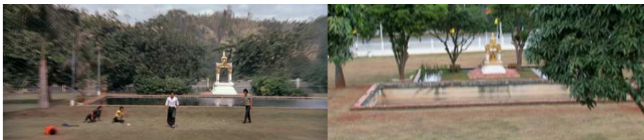
Just add water.