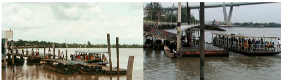
The ferryboat in the opening of "The Big Boss"