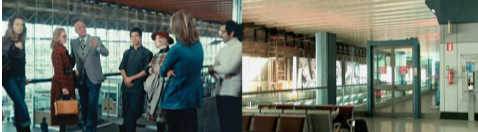
The airport in "Way of the Dragon" has changed, but a hint of 1972 remains.