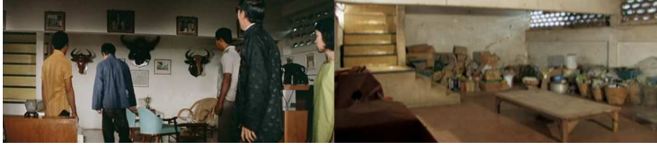
Other than needing a serious dust job, not much has changed.