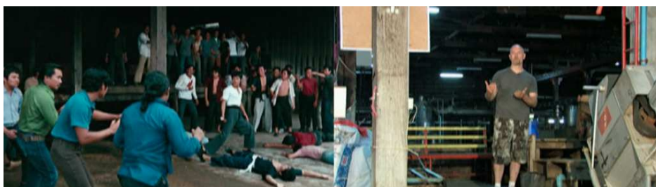
The wooden beam in the center of the ice factory still stands.