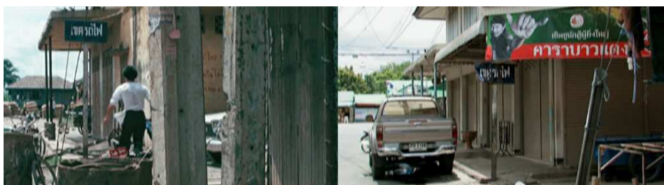
Amazingly, the sign Bruce runs under remains. I'm sure it'll end up on ebay one day.