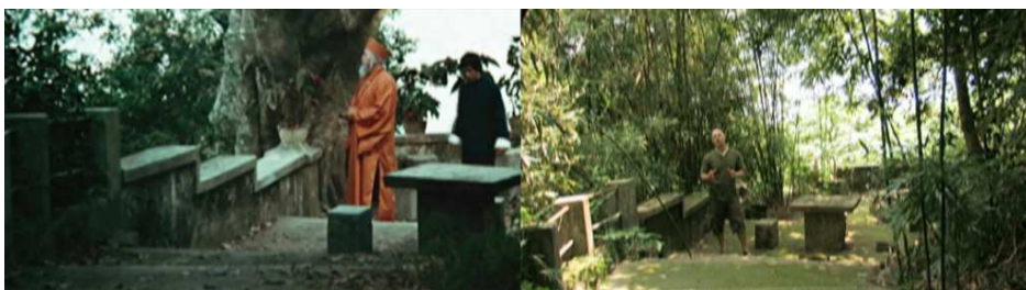
The location where Bruce and Roy Chiao exchange words in "Enter the Dragon" remains the same.