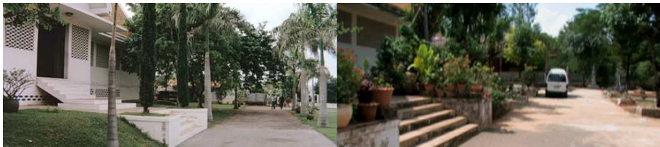
The grand staircase to "The Big Boss" mansion.