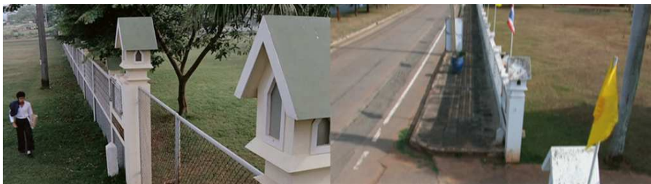
The gate entrance to the "The Big Boss" mansion.