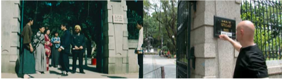
"No Chinese or dogs allowed" in Macau. The rest of "Fist of Fury" was shot in Golden Harvest studios.