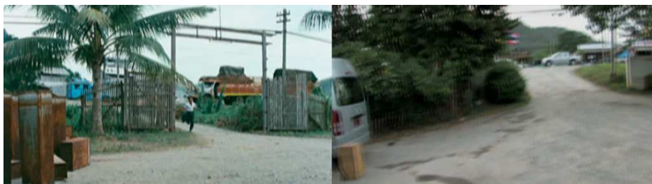
The entrance of the ice factory.