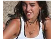
Madonna's Daughter Blossoms Into A Beauty