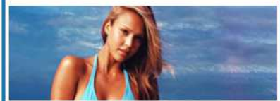
Getting By On Looks Alone