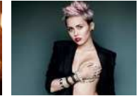
Miley's Raunchiest Photos Ever