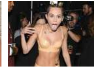
Miley Cyrus Admits She's Had A 'Messed Up' Life