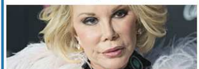
Plastic Surgery Nightmares