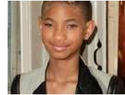
Willow Smith Finally Starts Dressing Her Age