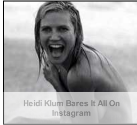
Heidi Klum Bares It All On Instagram