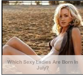
Which Sexy Ladies Are Born In July?