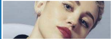
See Tons Of New Photos...