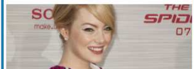
Best Actresses Under 25