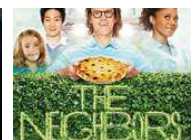
"The Neighbors: The Complete First Season" On DVD