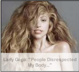
Lady Gaga: "People Disrespected My Body..."