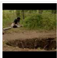
The pit @ 3:23

Full disclosure: This Blu-ray was provided to us for review. This has not affected the editorial process. For more information on how we handle review material, please visit our about us page to learn more.