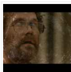
Bad moonshine trip @ 5:15