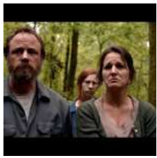
Sad faces all around @ 40:54