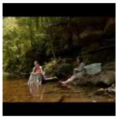
Laundry time @ 25:02