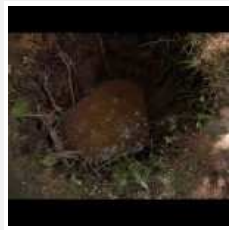
Yep, it's a pit @ 26:09