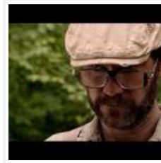
Facial detail @ 39:04