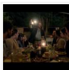
Dinner time @ 13:48