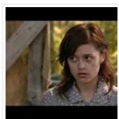
Worried eyes @ 12:53