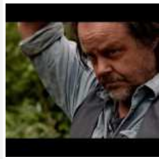
Facial detail @ 40:56