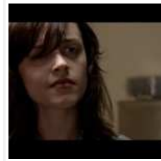
Doing her best Kristen Stewart impression @ 57:47