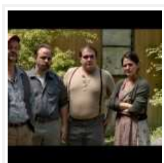
The fam @ 6:07