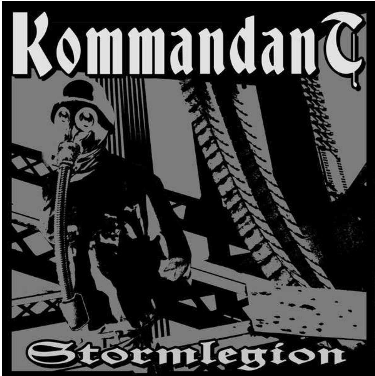
Kommandant Stormlegion Reissue