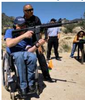
Dead Patriot Films

A scene from this documentary narrated by Ice-T.