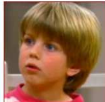
10 Child Actors Destroyed By Fame