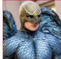
14 Movies You Must See in 2014