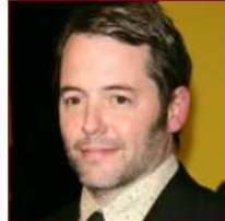
10 Actors Who Killed People In Real Life