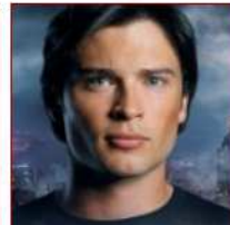
10 Shows We Should Have Just Quit Watching