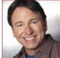
10 Actors Who Died On Set