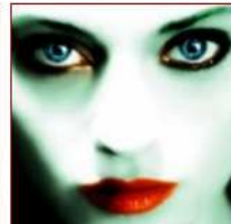
9 Awesome Movies You Probably Haven't Seen But Should