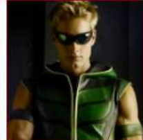
Terrible Attempts to Bring Superheroes to Life