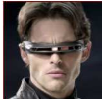
7 X-Men Characters Who Should Be Recast