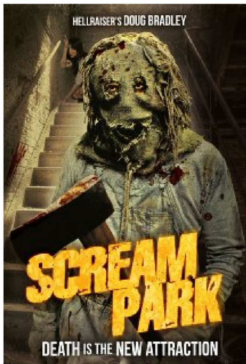
SCREAM PARK IS AN INDIE SLASHER "IN THE 80'S TRADITION", TOO BAD IT WASN'T THE GOOD PARTS OF THE 80'S TRADITION