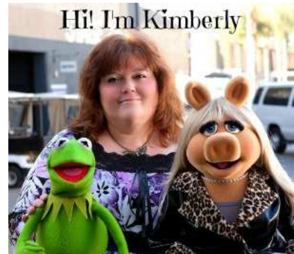
Click the photo to learn more about me and She Scribes