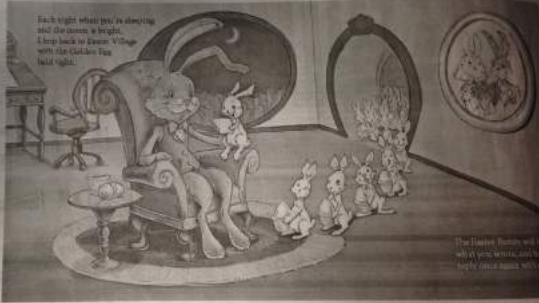
Here's a page from the children's book "The Bunny with the Basket & the Golden Egg."

Children can also expect a visit from the Easter bunny. For more information, visit bunnywiththebasket.com .