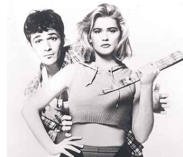
Kristy Swanson was the original "Buffy the Vampire Slayer."