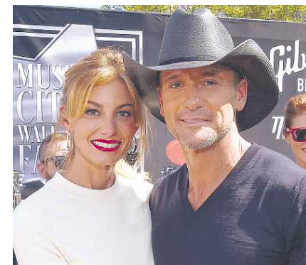
Faith Hill and Tim McGraw could be one "Voice" as advisers.

THE VOICE (8 p.m., NBC/4) — Singers Tim McGraw and Faith Hill serve as key advisers as the artists prepare for the Knockout Rounds; contestants will be paired against teammates and select a song to perform for the coaches.