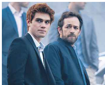
THE CW / DIVAH PERA

RIVERDALE The Archie comics take on deeper, darker tones in CW's film-noir first season, designed to mix/match eras and generations (ex-"90210" dude Luke Perry as Archie's dad, "Suite Life" kid Cole Sprouse as teen Jughead). Extras include featurettes exploring the concept's CW-zation and its murder milieu, music shorts, Comic-Con panel, more. (Season 2 starts Oct. 11.) List price: $40 for 13 episodes, either DVD or Blu-ray, out today from Warner. KINGDOM: SEASONS 1-2 Gritty martial arts family