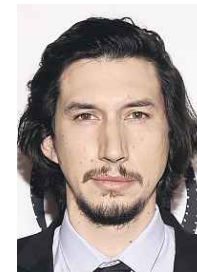
Adam Driver visits Seth Meyers.

CORDEN (12:35 a.m., CBS/2) — Lin-Manuel Miranda