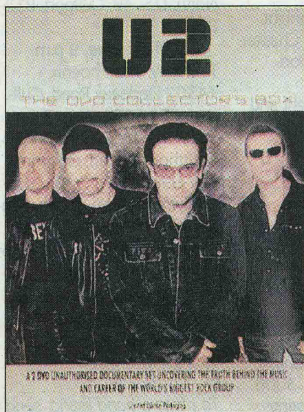
"DVD Collector's Box," U2 (Chrome Dreams/MVD, ★★★)

This two-disc June 5 release was made with fans and collectors in mind, including color picture discs, plus extensive interviews, previously unseen footage and insider information. However, like the Guns & Roses box reviewed awhile back, a disclaimer appears saying that there's no U2 music or performances included.