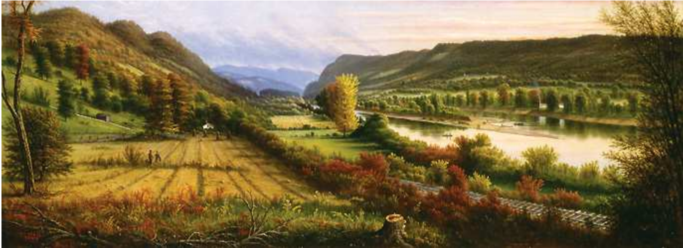
William Coventry Wall. View Along the Allegheny Near Aspinwall, PA, 1867. Westmoreland Museum of American Art |

Home | Neighborhoods | Features | Innovation | Development News | Wiki | In the News | Pop Filter | About Us | Sign Up