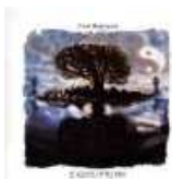
Equilibrium Audio CD

Buy albums, DVDs and book in association with Amazon