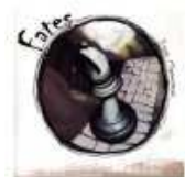
Fates Audio CD