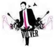
VOLVER soundslike Keane

brand your band - brand your band - brand your band - brand your band