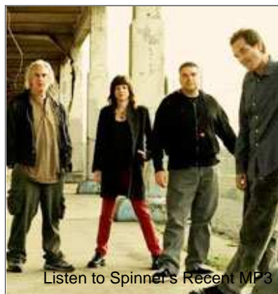
Listen to Spinner's Recent MP3 of the Day Picks