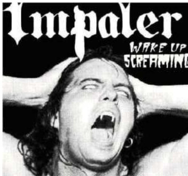
The cover for Wake up Screaming (1990)