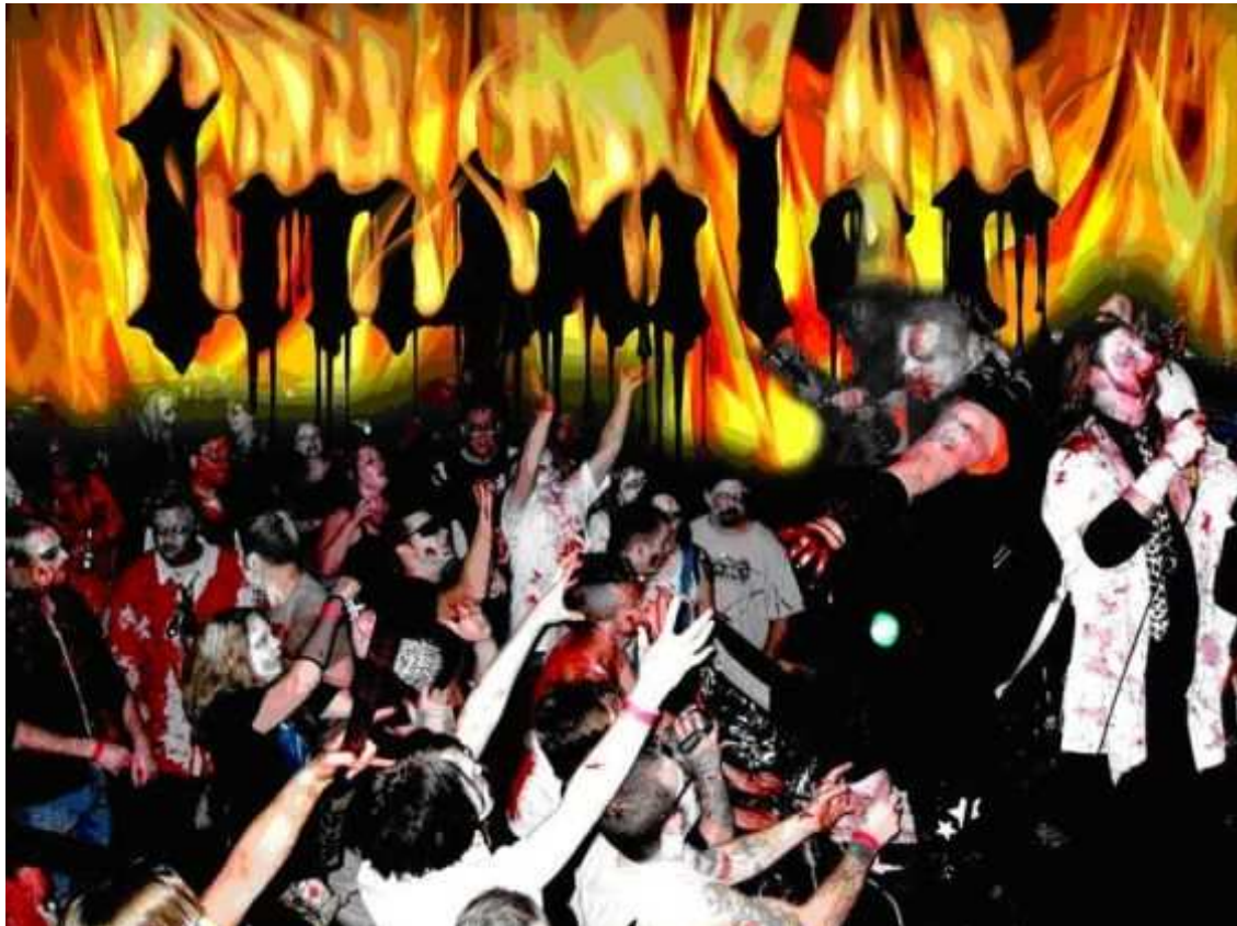
Zombie Pub Crawl at the 501 Club, Summer 2010