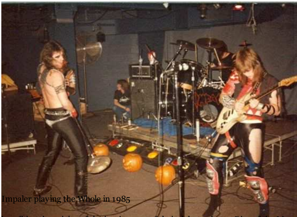
Impaler playing the Whole in 1985

Here's Bill describing the origins of the iconic cover of their debut release, Rise of the Mutants , and how the band were jettisoned into the spotlight due to their provocative stagershow and lyrics in 1985: