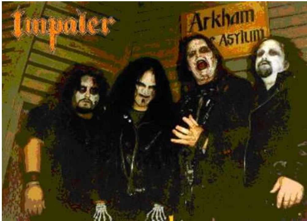
"The Last Ride" from Habeas Corpus (2005)

Impaler asks the immortal question, "Where is the Minnesota Iceman?" from 2009's "concept record" Cryptozoology